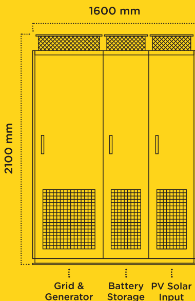
TYPICAL DIMENSIONS (60 kVA)